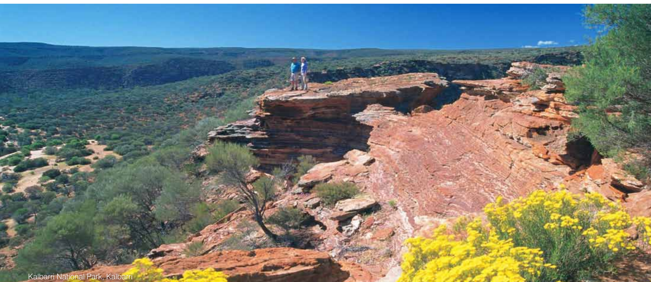
Kalbarri National Park, Kalbarri