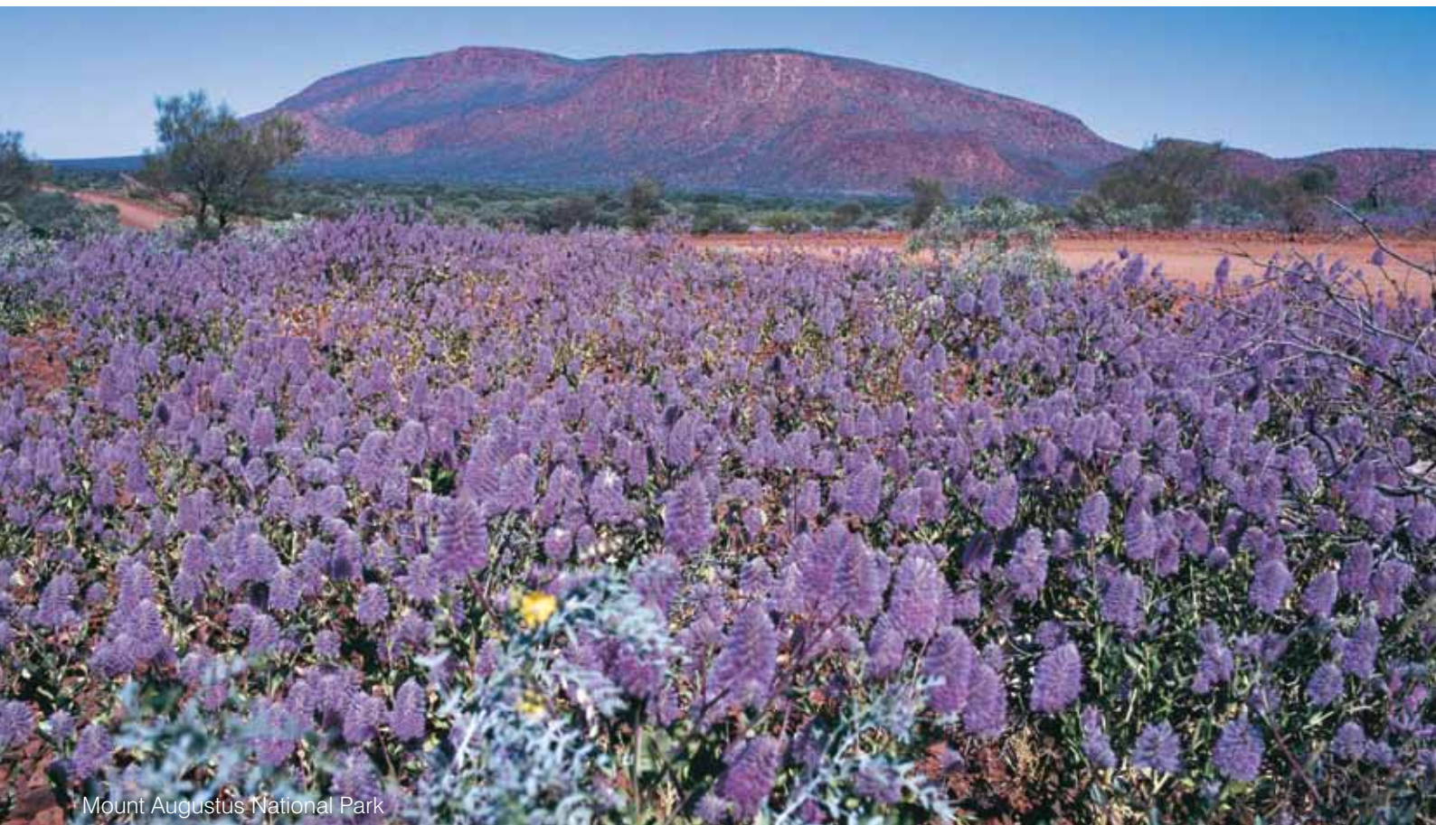
Mount Augustus National Park